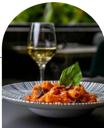
Food In Rome