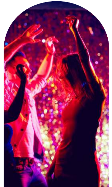
Nightlife in Rome